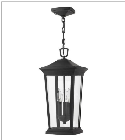
2362MB LARGE HANGING LANTERN 10" W, 19.3" H Socketed