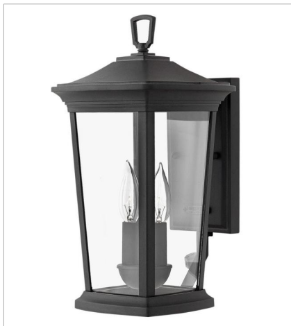
2360MB SMALL WALL MOUNT LANTERN 8" W, 15.5" H Socketed