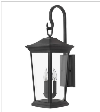
2366MB EXTRA LARGE WALL MOUNT LANTERN 10" W, 24.8" H Socketed