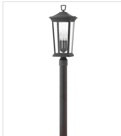
2361MB-LV LARGE POST TOP OR PIER MOUN... 10" W, 22.8" H Socketed