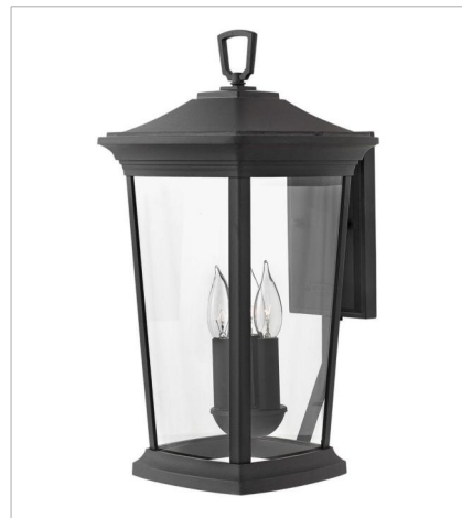
2365MB LARGE WALL MOUNT LANTERN 10" W, 19.3" H Socketed