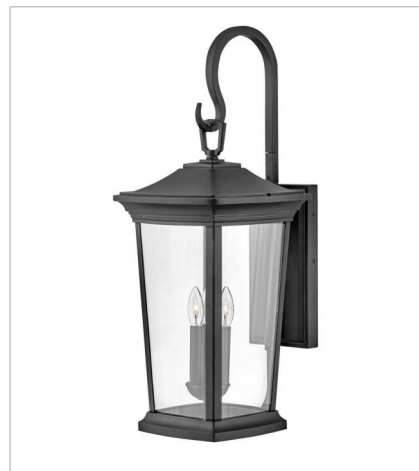
2369MB LARGE WALL MOUNT LANTERN 12" W, 30" H Socketed