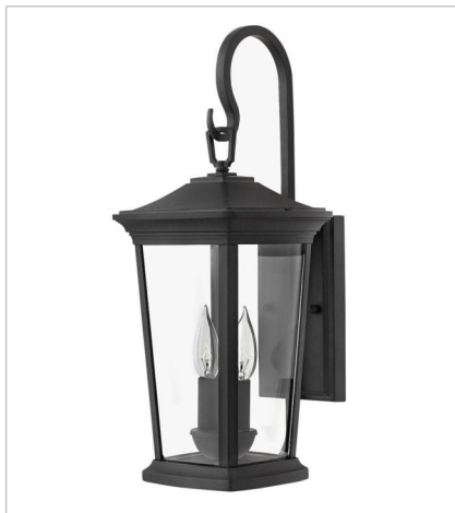
2364MB MEDIUM WALL MOUNT LANTERN 8" W, 20" H Socketed