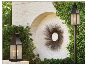
BEACON HILL™ Taking inspiration from an English lantern, Beacon Hill achieves a timeless aesthetic. Part of the Heritage collection, this traditional style features a striking Blackened Copper or Museum Black aluminum frame. The heavily seeded glass pays homage to its Old World charm.