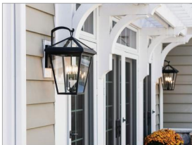
ALFORD PLACE™ The clean and classic design of Alford Place features a precision die-cast frame, hanging arm and top loop, paired with a sealed glass roof providing excellent illumination from all sides.