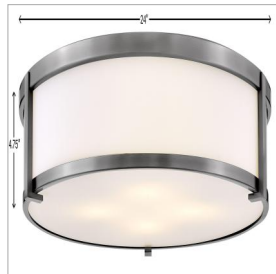
LOWELL™ Lowell is a transitional design with clean lines and a subtle Mid-Century Modern overtone. Robust cast L-bracket details combine with a twist lock system to maintain a sleek appearance that fits any décor.