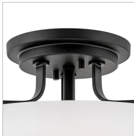
HARPER™ Harper's sleek, retro design elevates the traditional flush mount with a unique opal glass bound by a prominent metal ring and decorative knobs available in four finishes.