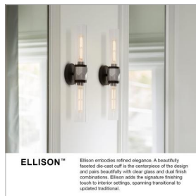
ELLISON™ Ellison embodies refined elegance. A beautifully faceted die-cast cuff is the centerpiece of the design and pairs beautifully with clear glass and dual finish combinations. Ellison adds the signature finishing touch to interior settings, spanning transitional to updated traditional.