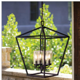
ALFORD PLACE™ The clean and classic design of Alford Place features a precision die-cast frame, hanging arm and top loop, paired with a sealed glass roof providing excellent illumination from all sides.