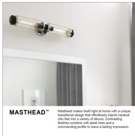
MASTHEAD™ Masthead makes itself right at home with a unique transitional design that effortlessly injects nautical chic flair into a variety of décors. Contrasting finishes combine with sleek lines and a commanding profile to leave a lasting impression.