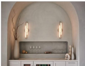
EOS™ Clean and contemporary, Eos is simplicity at its finest with a double dose of style. Offset etched glass tubes are striking in any of three finishes: Black, Brushed Nickel or Chrome. Slim and streamlined, Eos makes a dramatic impact whether mounted horizontally or vertically.