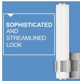
AIDEN™ Bold and balanced are the defining elements of Aiden. A striking, signature cuff centers the etched white glass baton, while matching end caps complete the simple symmetry. The clean transitional silhouette can be mounted vertically or horizontally with Invisimount for a look that is as flexible as it is fashionable.