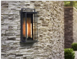
LANGSTON™ Sleek but stately, Langston demands attention with its bold silhouette in Black and a gleaming Burnished Bronze reflector. Available as an over-scaled option, Langston delivers a stunning light beam spread thanks to its extra-large panes of clear glass.