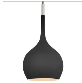
ZIGGY™ The Ziggy pendant easily adapts to a variety of spaces with its effortlessly modern silhouette. The contemporary, ultra-matte or clear glass shades are counterbalanced by contrasting accents and matching stems.