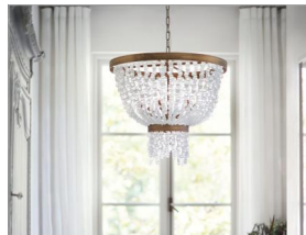
DUNE™ Dune's bohemian chic design showcases strands of soft sea glass combined with a Burnished Gold finish. The design blends a sophisticated silhouette with organic elements inspired by sun and surf. Dune infuses any space with a timeless, mesmerizing elegance.