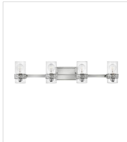
5514PN FOUR LIGHT VANITY 34" W, 7" H Socketed