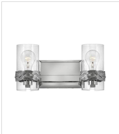
5512PN TWO LIGHT VANITY 14" W, 7" H Socketed 2-14w Med. LED, 100w Equiv. or 2-100w Med.