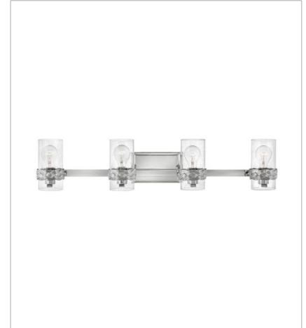
5514PN FOUR LIGHT VANITY 34" W, 7" H Socketed