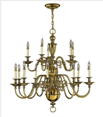
4417BB LARGE TWO TIER 37" W, 34.8" H Socketed 15-5w Cand. LED, 40w Equiv. or 15-40w Cand.