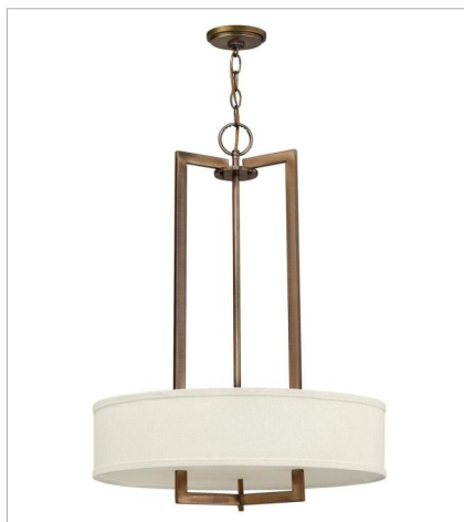
3203BR SMALL DRUM 20" W, 26.5" H Socketed

FINISH: Brushed Bronze SHADE: Off-White Linen Hardback