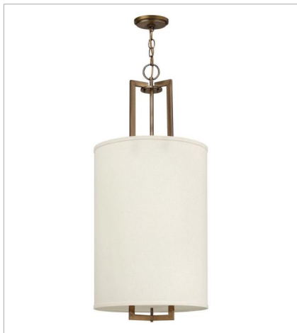
3205BR LARGE DRUM PENDANT 16" W, 32.8" H Socketed

FINISH: Brushed Bronze SHADE: Off-White Linen Hardback